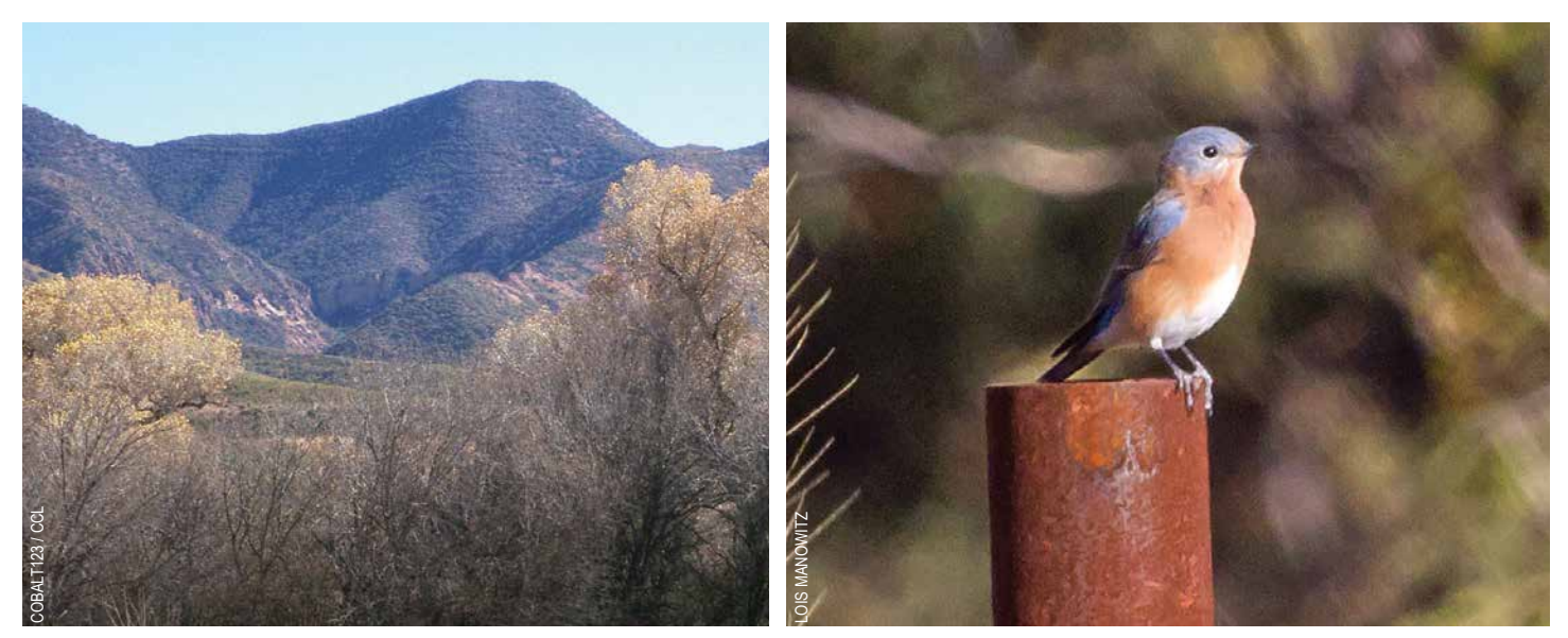
There are many species of conservation concern and high birder interest associated with the extensive oak and meadow habitat of the Patagonia Mountains (bottom left) including a bird that not many local birders even realize is around but can almost certainly recognize at a glance, Eastern Bluebird (bottom right).

The Arizona IBA crew will continue to survey for Azure Bluebirds in the Patagonia Mountains in the face of several threats to this area including the Wildcat Silver Mine. The Patagonia Mountains are the most significant habitat for these birds and we will endeavor to keep this area "for the birds."