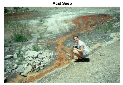
Acid Seep in Nevada

The metals dissolved by the acid drainage poison downstream waters, in many cases to the point where nothing other than microbes can survive. Although mining is by far the largest cause of this type of acid leaching, the process can also occur during nonmining land disturbances such as construction, or even naturally in some environments, examples of the more general phenomena of "acid rock drainage" (ARD).