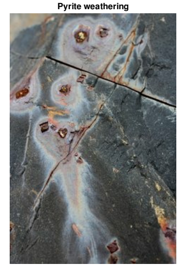
Iron sulfide (aka pyrite or fool's gold) weathers in the air, releasing sulfuric acid, and iron that then oxidizes and stains the rock.

Acid mine drainage is often encouraged by a biological feedback loop. Once acid mine drainage starts, certain microbes thrive in the acidic environment. These microbes increase the production of sulfuric acid from the surrounding rock, further poisoning the downstream environment for other organisms. This feedback loop is an important component in all the most severe cases of acid mine drainage.