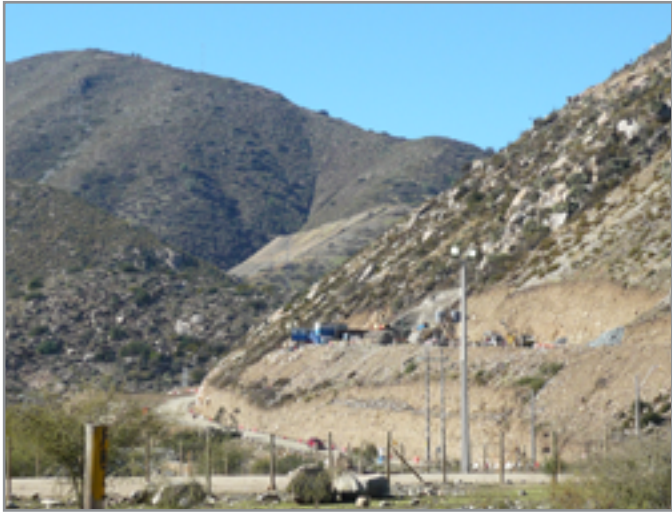
Erosion near a mining road, Pelambres mine, Chile

sensitive areas or are near previously isolated communities. If a proposed mining project involves the construction of any access roads, then the environmental impact assessment (EIA) for the project must include a comprehensive assessment of the environmental and social impacts of these roads.