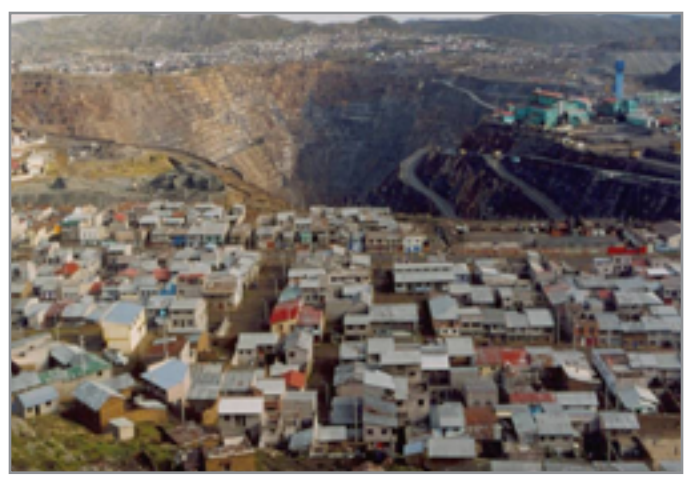
Open-pit mine in Cerro de Pasco, Peru

In many cases, logging of trees and clear-cutting or burning of vegetation above the ore deposit may precede removal of the overburden. The use of heavy machinery, usually bulldozers and dump trucks, is the most common means of removing overburden. Open-pit mining often involves the removal of natively vegetated areas, and is therefore among the most environmentallydestructive types of mining, especially within tropical forests.