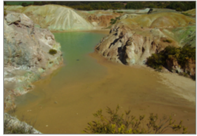
Overburden drainage at an Australian mine

the slope to be revegetated either naturally or with human assistance."<sup>3</sup>