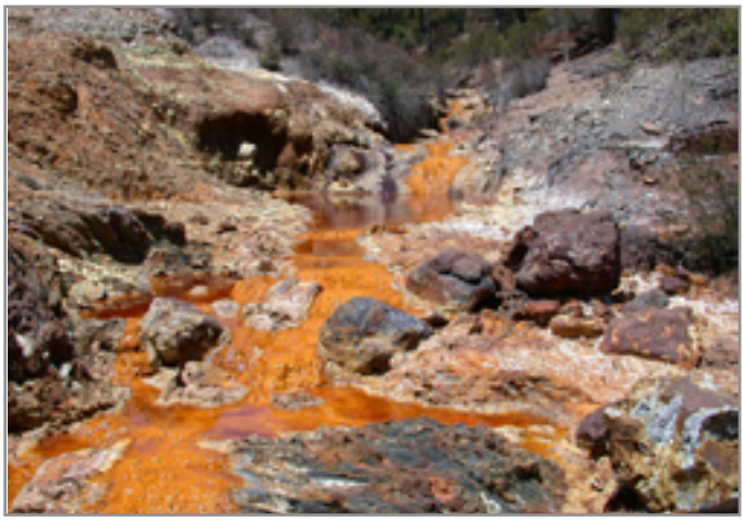
Acid mine drainage

Acid drainage and contaminant leaching is the most important source of water quality impacts related to metallic ore mining.