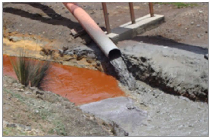
Wet tailings disposal at a mine in Peru

"Riverine (e.g., rivers, lakes, and lagoons) or shallow marine tailings disposal is not considered good international industry practice. By extension, riverine dredging which requires riverine tailings disposal is also not considered good international practice."<sup>1</sup>